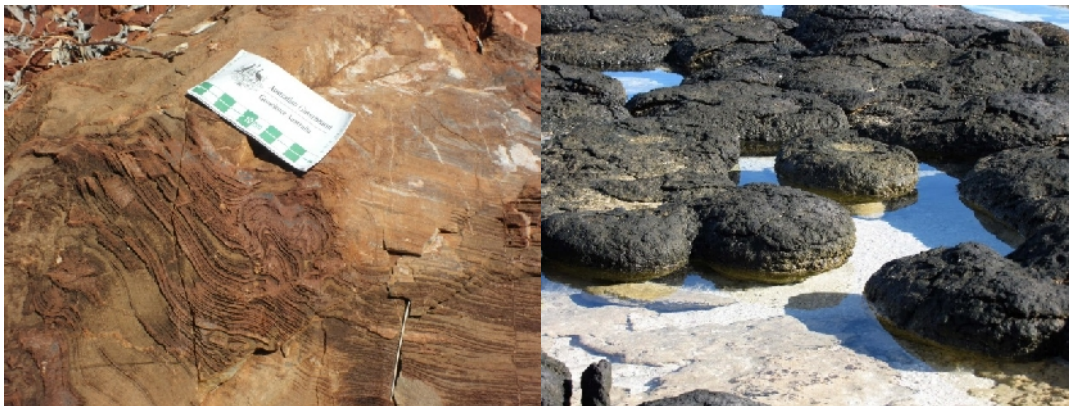
(Above) On the left fossilised stromatolite patterns in the Pilbara with their living cousins from Shark Bay and (Below) living examples beneath the water line at Carbla Point.

What can be viewed at Shark Bay (as well as some other locations around WA and the world) are living examples of the fossils from the Pilbara. By examining the shape and structure (morphology) and how growth develops and under what conditions, comparisons can be made to geological sites and being able to identify the characteristic curves to classify these fossilised structures. Through examination of the living world we hope to understand our ancient past and unravel the history of the Earth.