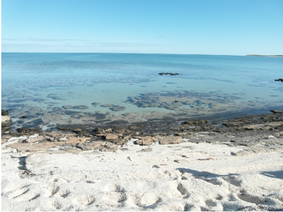
(Above) One of first (and last) views of the stromatolites at the beach at Carbla Point.