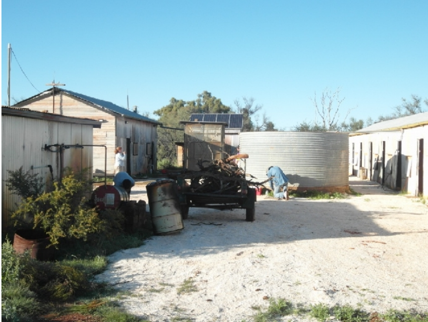
(Above) Overnight accommodation at Carbla Point, in the left background is the food preparation area and dining hall.

After leaving the luxuries of Carbla Station behind, it was time to get back into some stromatolite science at Shark Bay.