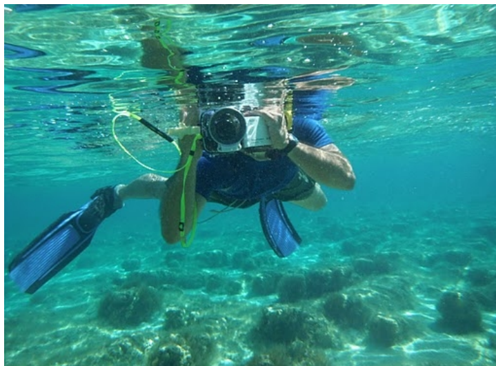
(Above) A real highlight for the day was to swim with the stromatolites, to get up, close and personal with these objects (even though it was only 16°C-planetary scientists are a tough bunch!) and then to discuss the scientific possibilities and probabilities.