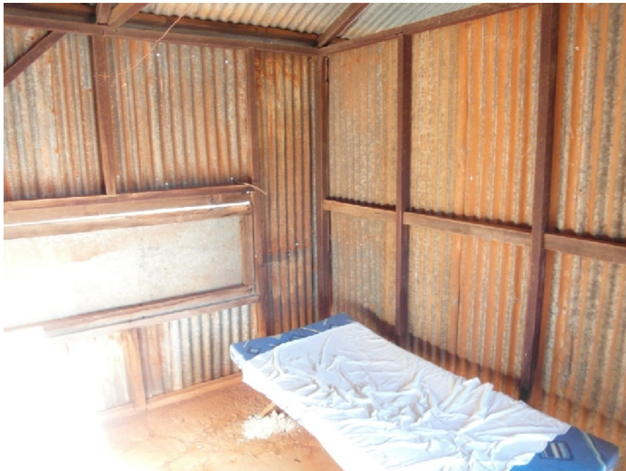
(Above) Traditional style Shearer's quarters-a home away from home at Carbla Station

Shark Bay is a UNESCO World Heritage Site located around 800 km North of Perth. The region has a well-documented history, with the area first identified by Dutch explorer Dirk Hartog in 1616. In fact he landed on an island just off Shark Bay (now called Dirk Hartog Island) and left a pewter plate with an inscription marking the occasion. The actual Hartog